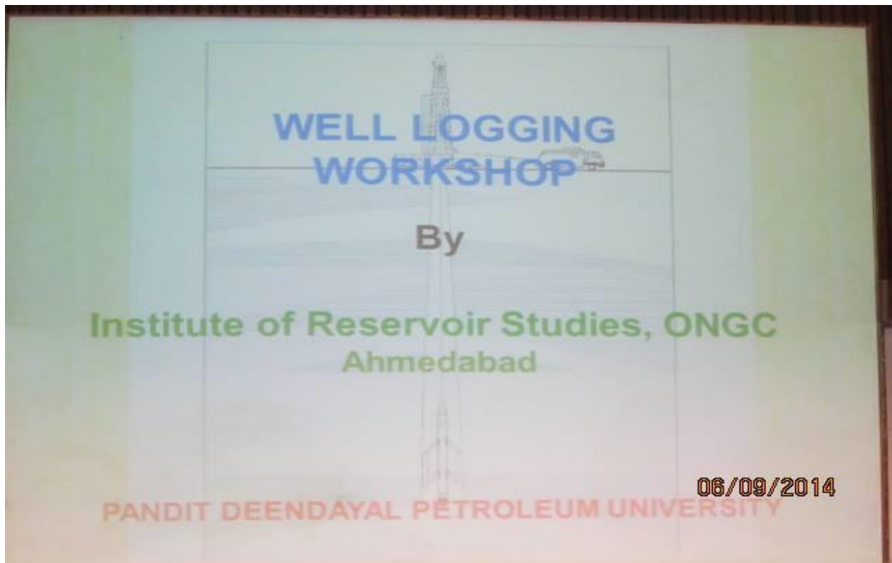
Introductory presentation of usage of Well Logs