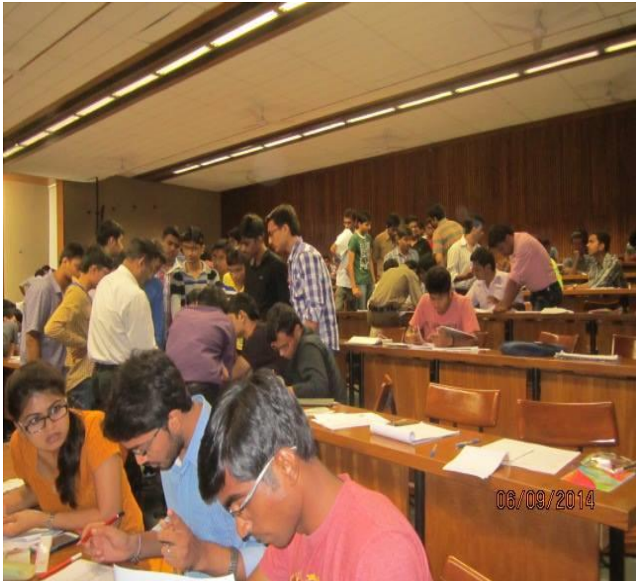
Students getting hands on Well Logs!!