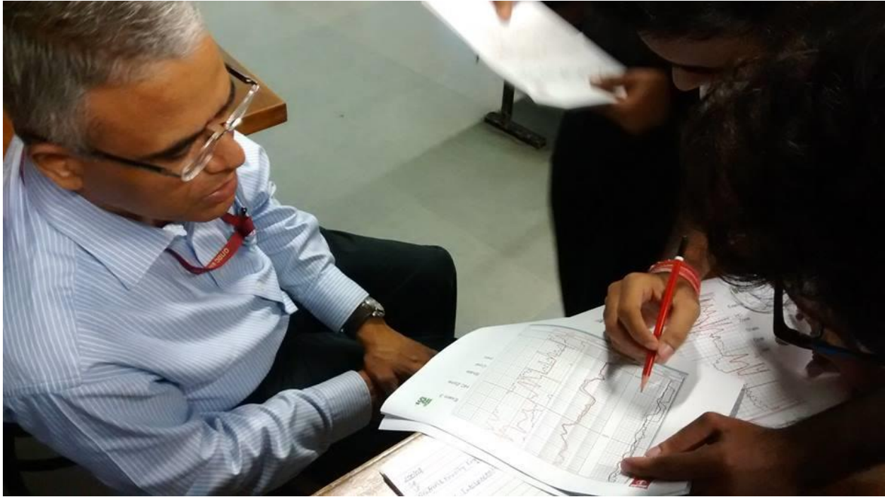
Students seeking clarification