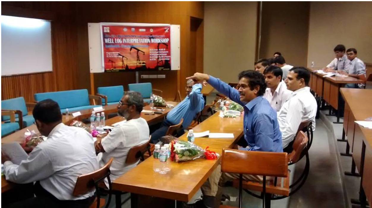
Everyone has an opinion!!!