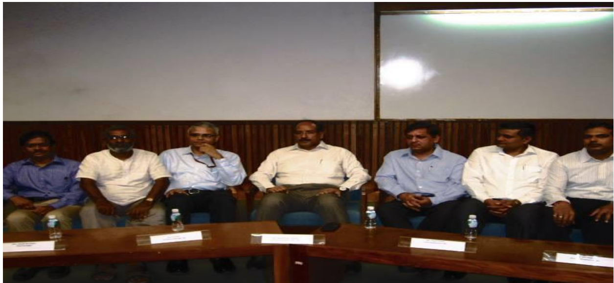
Eminent Geophysicists and Geologists sharing the stage