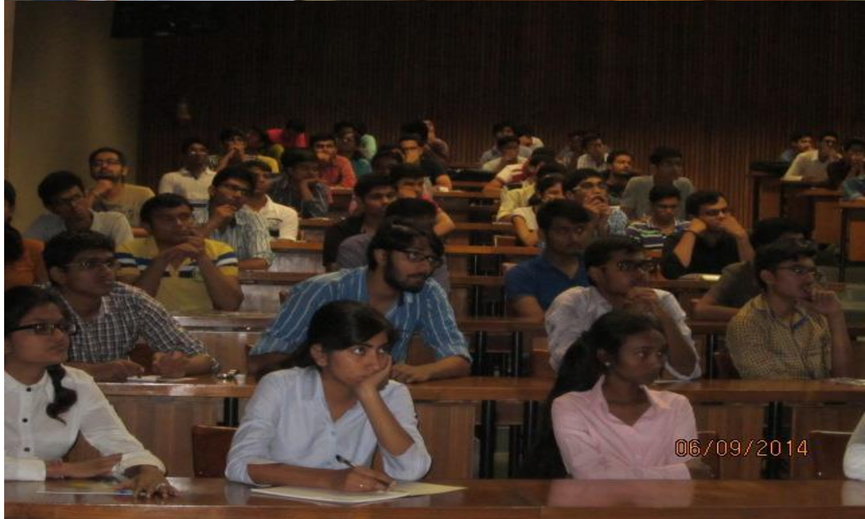
Students learning with keen Interest