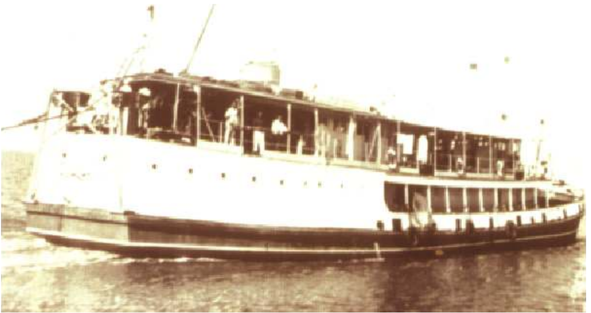
First Indian Seismic Vessel M/V Mahindra 1964-68