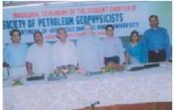
Inaugural Ceremony of SPG Student Section at BHU