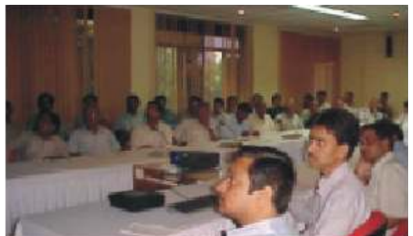
Audience at SPG Jorhat Lecture on 11 th Oct. 2002