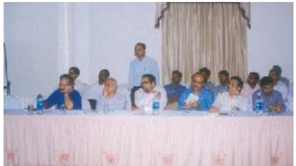
Audience interacting with faculty at Chennai