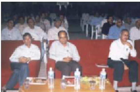
Section of audience at SPG Vadodara Meet on 1 st September 2002