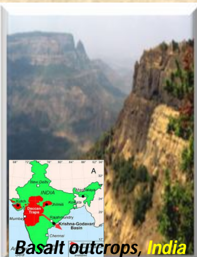
Basalt outcrops, India