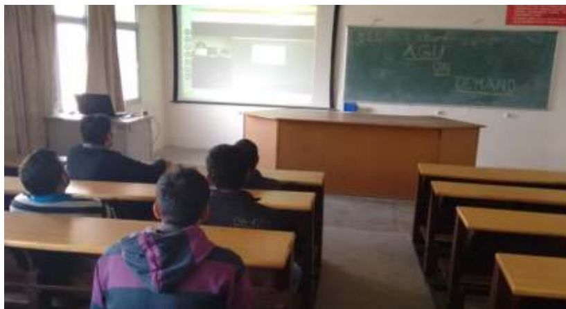
Students attending webcast in the seminar hall, IIT Roorkee.