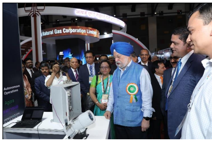
Hon'ble minister visiting various stalls put up at the exhibition hall of JECC.

SPG, being the flagbearer for various geoscientific activities in India, was invited to exhibit its activities. SPG earnestly participated in the event and showcased its various initiatives and schemes aimed towards the development of geosciences in the country. The conference acted as an ideal venue to spread and promote the functioning of SPG India, where in its round-the-year activities in form of technical talks, field workshops, student training, publication of various technical papers in its journal, GEOHORIZONS , and the premiere biennial International Conference and Expositions was highlighted through various posters and videos. The SPG executive members, Shri Shashwat Shubhra and Shri Abhishek Mishra represented SPG at the conference.