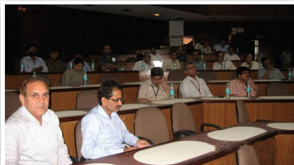
Audience in GBM