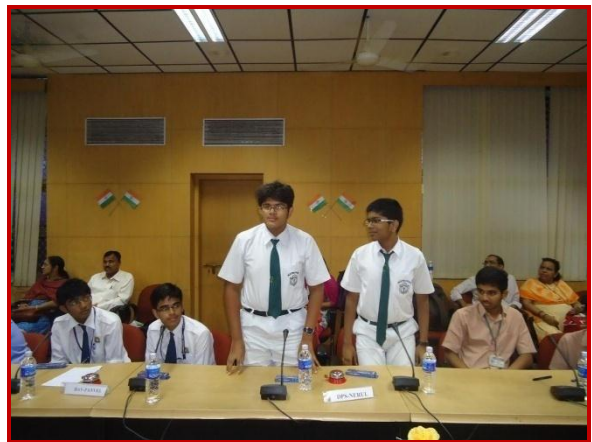
Team from DPS, Nerul being introduced