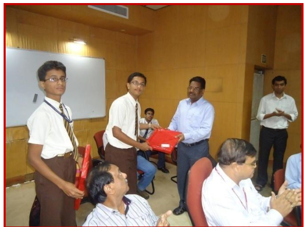
Team of Apeejay Kharghar; Second Prize