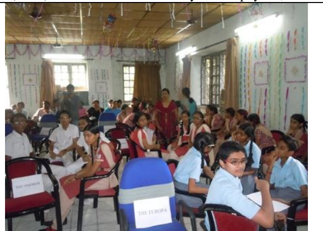
Preliminary round of Quiz competition on 27-07-2013.