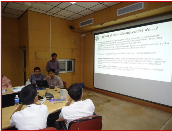
Presentation on SPG activities