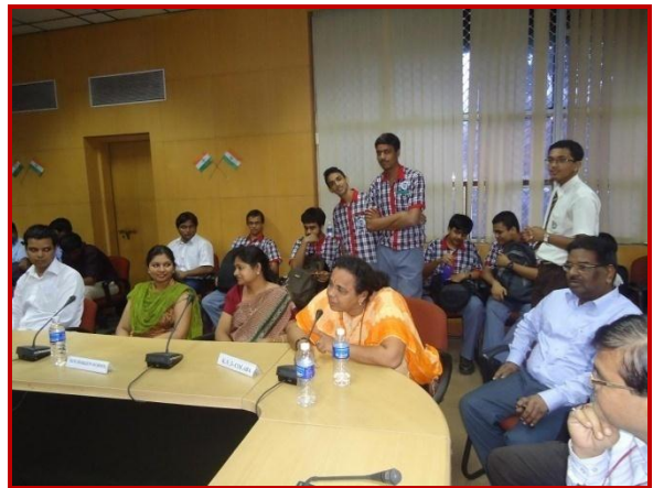
Feedbacks from the teachers