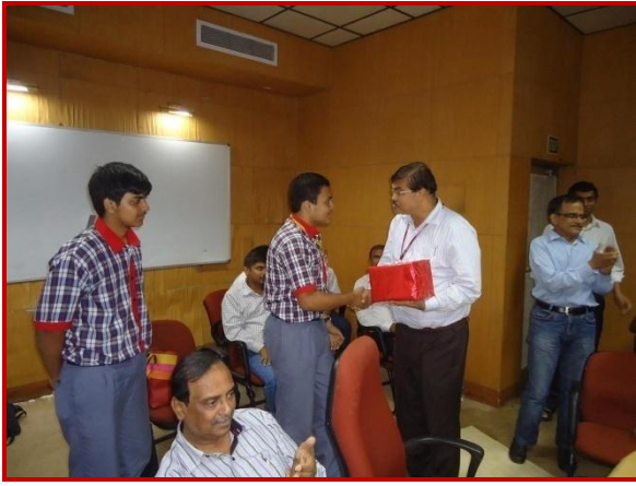
Team of KV-IIT, Powai; Winner