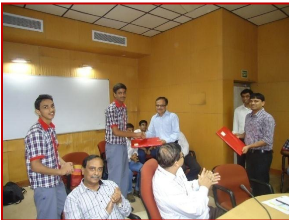
Team of KV-2, Colaba; Third Prize