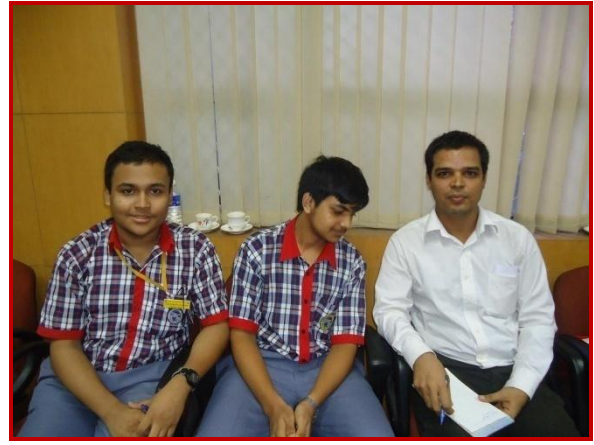
KV-IIT Powai Team with their teacher