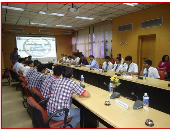
Quiz in progress