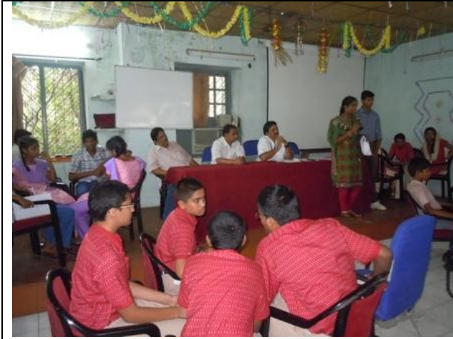
Quiz Master conducting Quiz competition to High School Students. Few Faculty members are also seen.