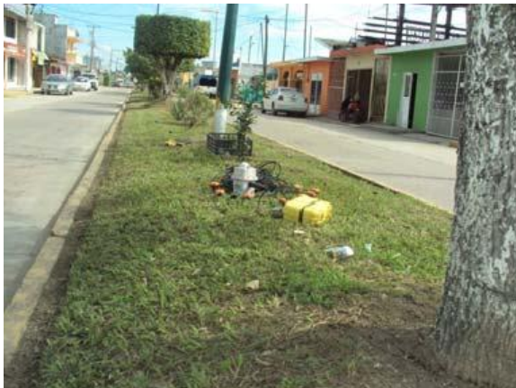
Figure 1: Receiver station planted in median in suburb of the city

The vibrator effort used in the towns was 2 Envirovibs (nominal peak force = 17000lbs) with 8 sweeps of 14 seconds.