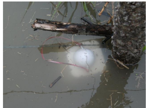
Figure 2: Submerged RAU still acquiring data

During the survey acquisition the city experienced very heavy rainfall and severe flooding that caused complete cessation of recording. Many areas were under more than a metre of water and, because of the ground anchors, many of the RAUs were completely submerged (Fig 2.) Ultimately, data acquisition in one portion of the survey area was abandoned (see Fig 4,) but it was a great relief that when the RAUs were recovered it was found that most were still actively recording data and that the data that had been stored could be successfully retrieved.