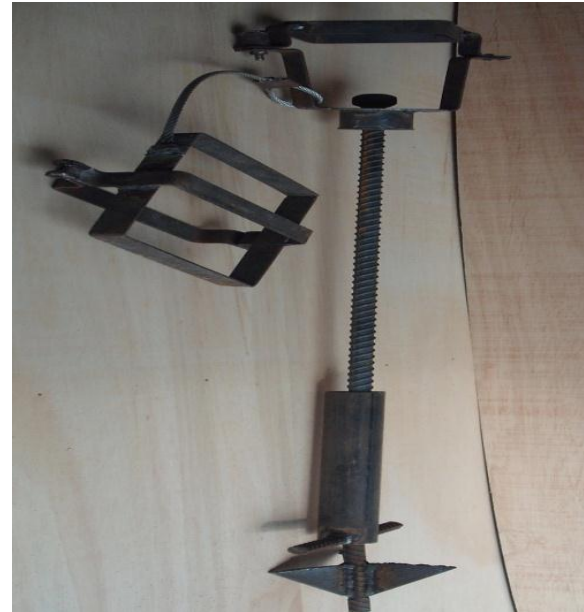
Figure 3: Ground anchor for securing RAUs

Another feature of this recording system was of particular benefit in this situation and was another of the reasons for its selection. This is known as the "lo-jack" or "anti-theft" mode. If a RAU is stolen, and when the external battery is removed, all of the LEDs on the box are extinguished and the box appears to be "dead." However, when the RAU is in this mode, although not recording data a small internal battery keeps the system working and it will wake-up periodically and send out a signal giving its GPS location and asking whether there are any harvesting units within Wi-Fi range. If there aren't any, it will revert to its dormant state until the time for its next check. This helps conserve battery power for approximately 20 days while in lo-jack mode, permitting ample time for recovery of the data and, if possible, the RAUs themselves.